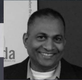
JP GOPALAN CULTURAL MINISTRY GREATER TORONTO AREA