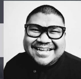
EJAY TUPE URBAN MINISTRY TORONTO